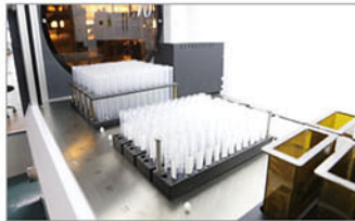
Sample & Reagent & Dilution Rack Module Original sample tubes available; Rack positions programmable.