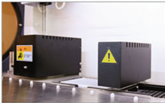
Microplate Reader & Washer Module Modularized automatic control reading and washing system.