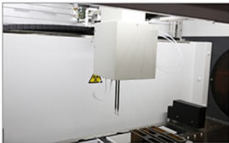
Sample Module Hitech teflon coating probe to prevent cross contamination.